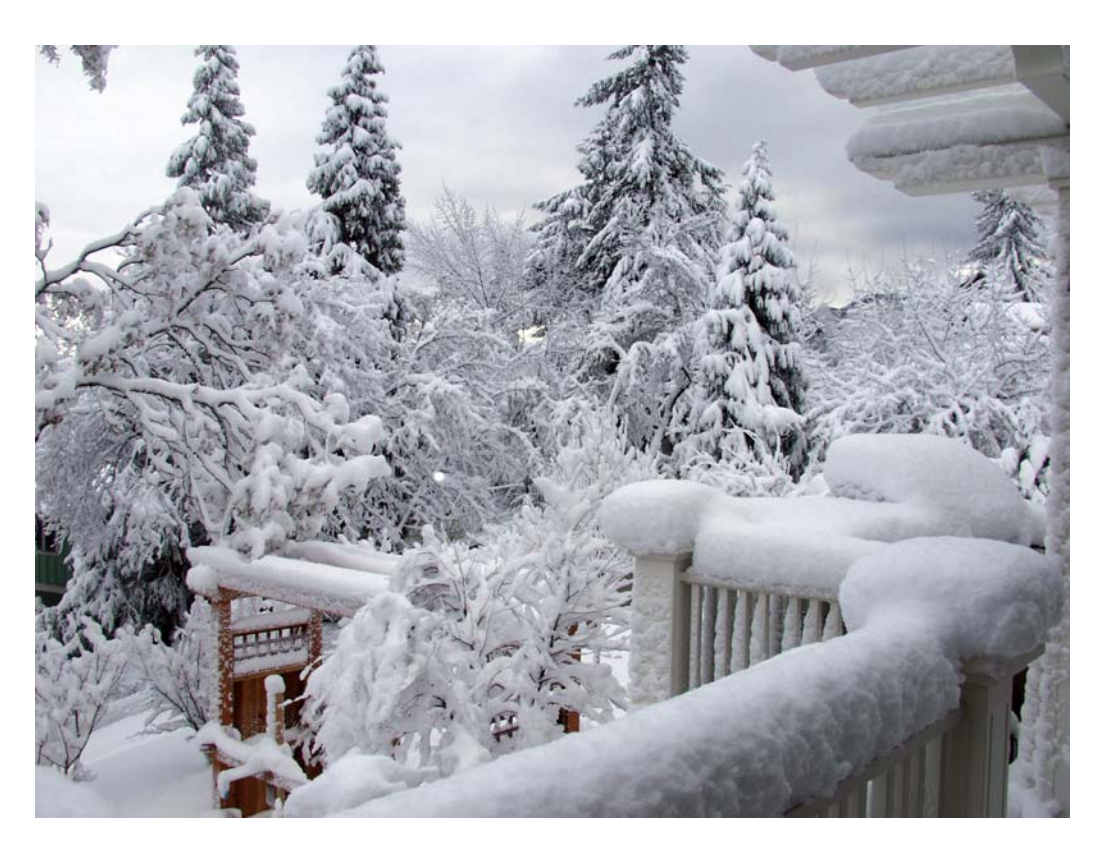
View from the same place, but showing the snow on top of the railing