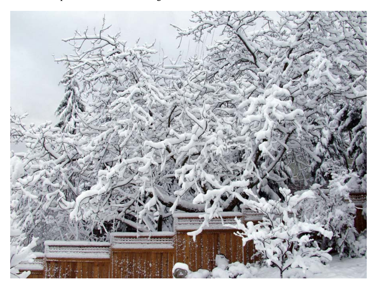
You're looking at the back fence. Most of what you see is the walnut tree that grows through the fence, with most of its branches on the neighbor's side.