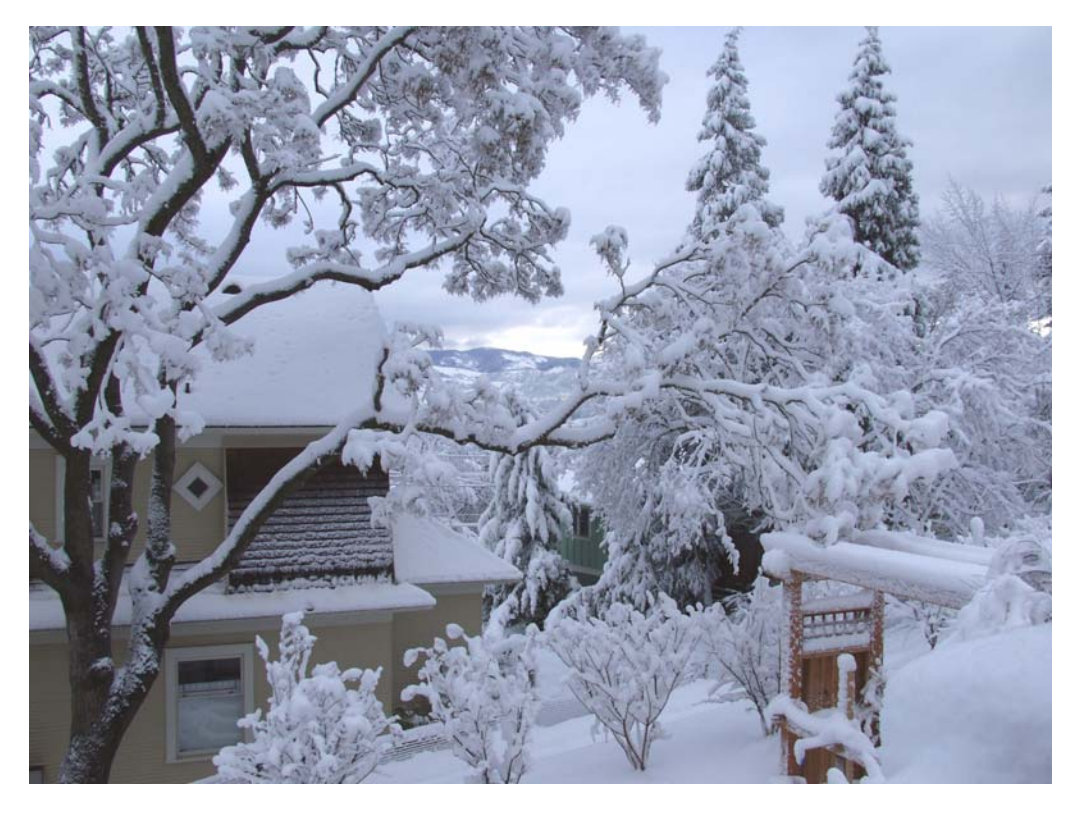
View to the east from the patio