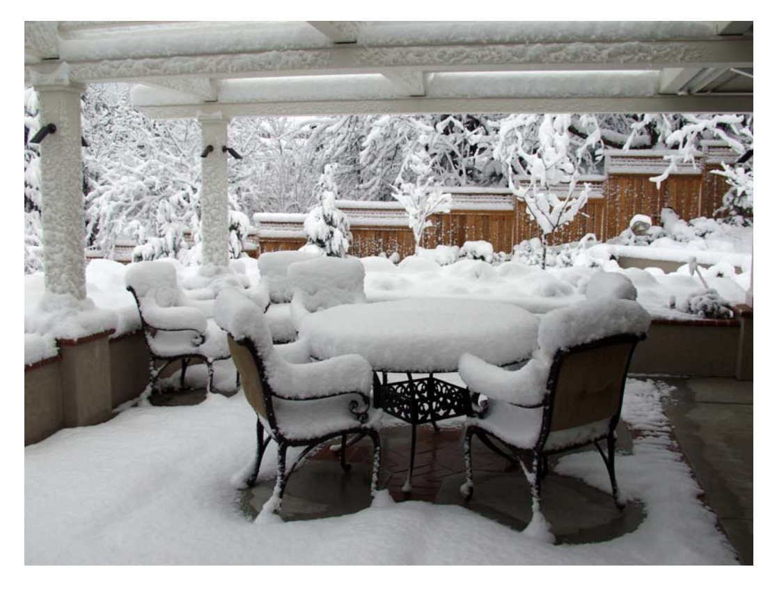
Snow on the patio furniture