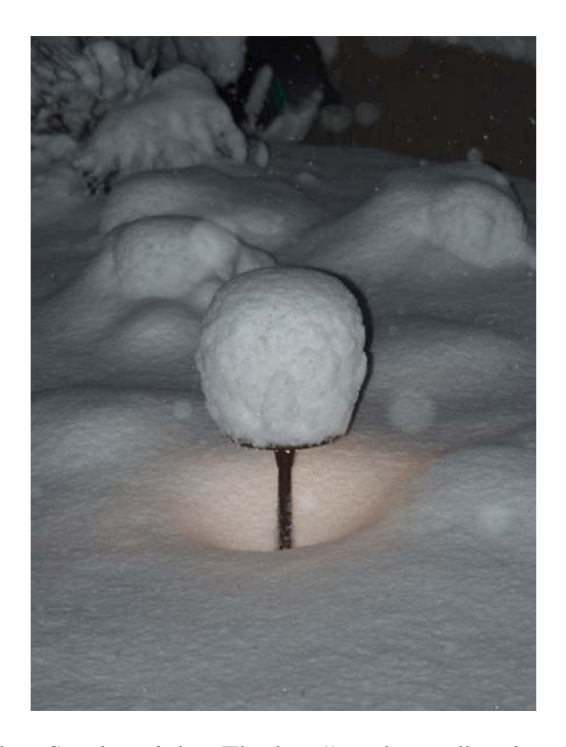
This picture was taken Sunday night. That's a "mushroom" style patio light with a pile of snow accumulated on top