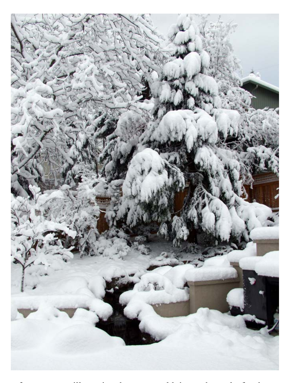
The water feature was still running, but you couldn't see the rocks for the snow. The cedar tree in the corner was heavily laden.