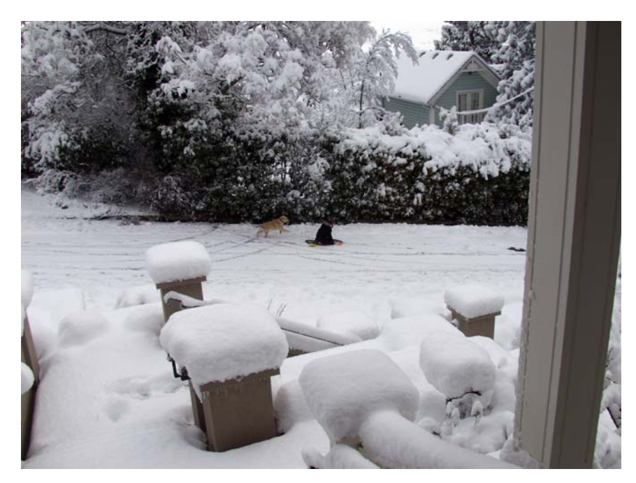
Manzanita street is steep enough to provide pretty good sledding. Somewhere in the foreground are our front steps.

This is a view from the front porch. Note that the Christmas lights haven't come down yet, and since taking them down will require climbing on the roof, it won't happen soon.