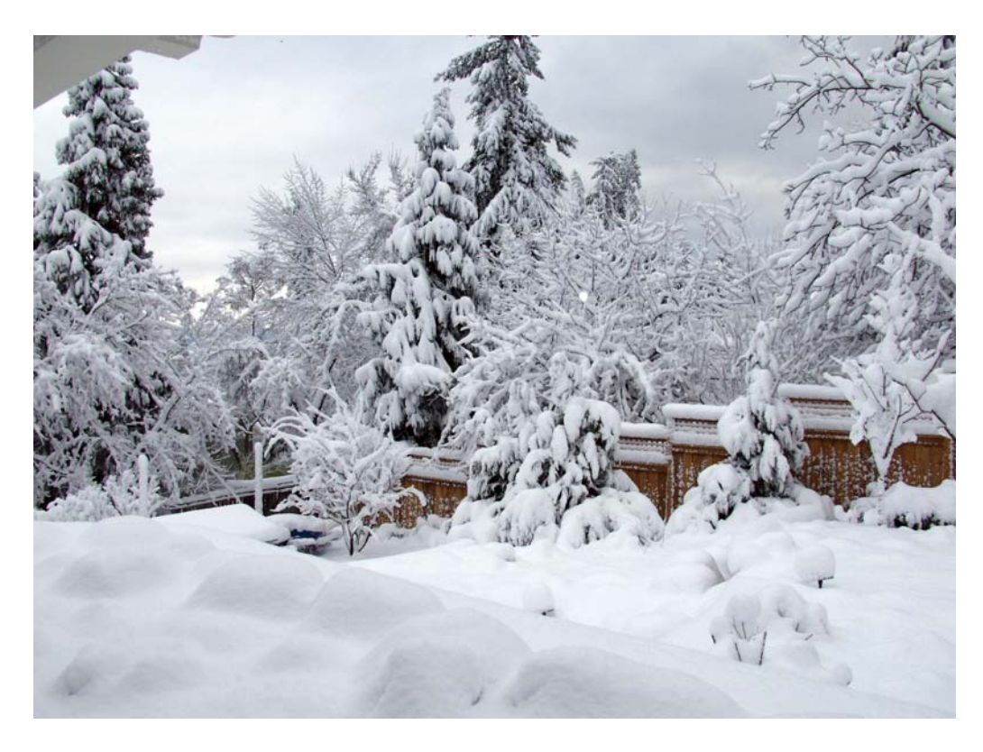
This shot was taken from the patio. The mounds of snow in the foreground are covering herbs in the planter.